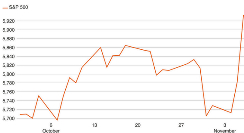
Return of the Trump trade

inflation that remains above the desired 2% level. The Fed's favored indicator of inflation, core PCE, or personal consumption expenditure, saw a 2.8% year-over-year increase in November. In Q3 2024, the US economy grew by 3.1% annually, demonstrating its continued strength. Hurricanes and strikes caused some distortion in the labor market data that was reported during the quarter, but unemployment remains low at 4.1%.